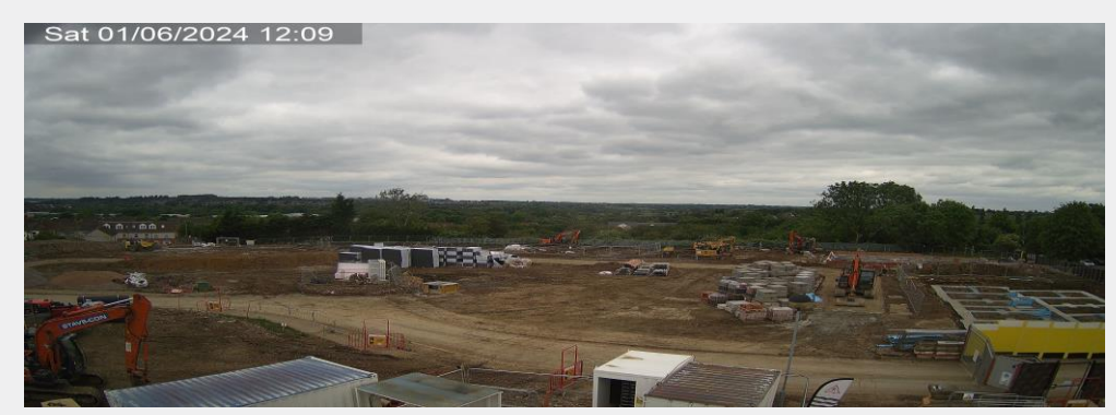
We would like to thank the local community for their understanding, patience and co-operation throughout the works.

Willmott Dixon has your safety in mind at all times and will take every measure to prevent unauthorised access onto our site.