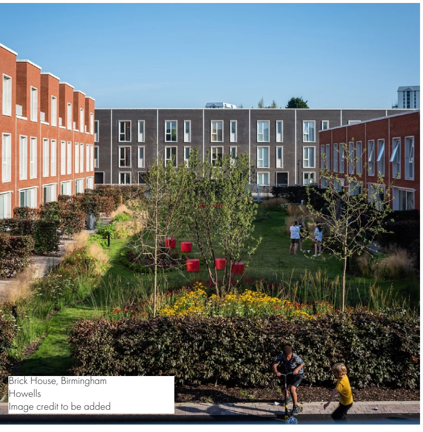
Houses with direct access to a useable, communal garden via individual patio areas