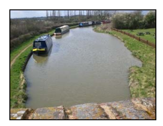
The Oxford Canal is a key element of Rugby's green infrastructure

1.7.3 Parks and green spaces provide an outdoor environment for children to learn through play and close social and family interaction. Green spaces provide important wildlife habitats and corridors. Attractive walking and cycling routes and riverside walks provide opportunities for recreation and traffic free routes. Urban green spaces in particular have an important role in mitigating the impact of climate change e.g. their cooling and shading effects are likely to become more important with hotter summer temperatures. The benefits of open spaces can be reduced or negated if green space is badly located, badly designed or poorly managed and maintained.